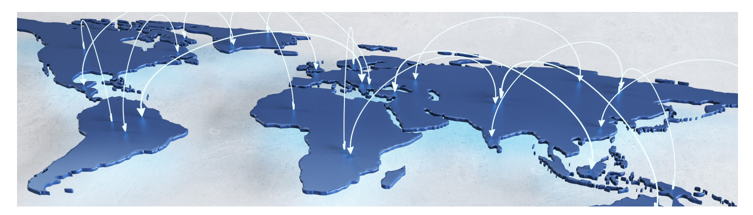
Figure 1: a failed SSD can negatively affect a data center and its global reach

In a data center, losing a drive or multiple drives without backup, redundancy or data protection can be devastating as customer records, critical business data, IP and other important files could be permanently gone within the blink of an eye, and its reach can affect other data centers and many users globally (Figure 1). SSDs in a fault tolerant configuration (such as RAID) provide essential redundancy to protect data stored on multiple drives.